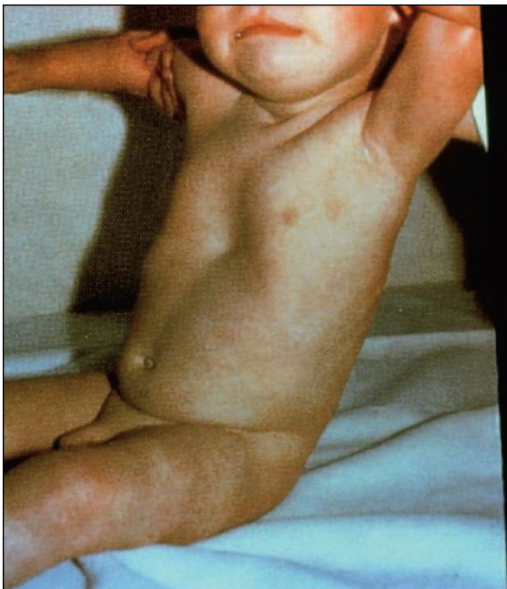
Figure 3. Intercostal and substernal retractions.

Physical examination of the respiratory system starts with assessment of the work of breathing. Close monitoring and frequent reassessments in an intensive monitoring setting are paramount. Again, patients who have neuromuscular disease present with shallow, ineffective respirations. Decreased work of breathing with more