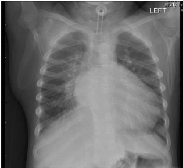
Figure 2. Chest radiograph revealing mild cardiomegaly and increased pulmonary markings.