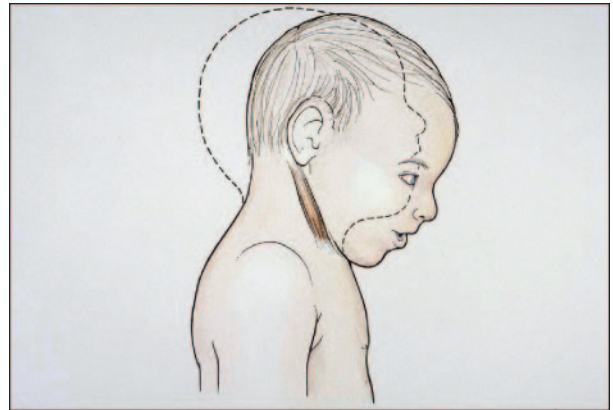
Figure 4. Head bobbing.

superficial respirations along with worsening mental status are ominous signs and signal severe respiratory failure and impending arrest.